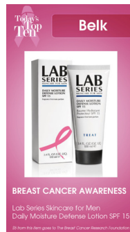
Breast Cancer Awareness