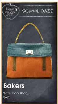
Back to School